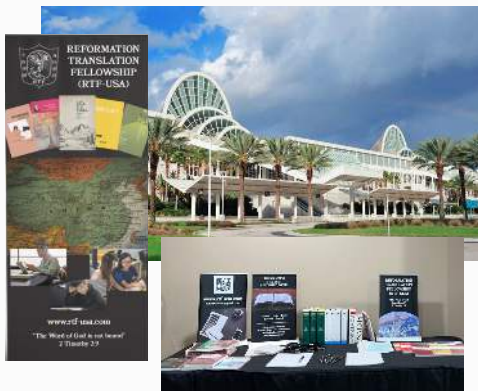
Convention Center and Conference Table

Especially important is the nurturing of our relationship with Ligonier Ministries. RTF-USA has had a connection to Dr. RC Sproul since 1993, when he kindly agreed to serve on our Board of Reference, a voluntary board that provides theological advice and guidance in our effort to translate the