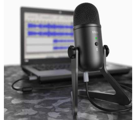
Some of the basic equipment in use for the production of our audiobooks at www.rtf-usa.com .

Can you help us with this worthy project? Do you have audio editing skills that could help this project along? Would you help us with the increased costs involved? We are also in need of recording equipment and expertise in this field. Please pray for these books as they are used by many Christians around the world.