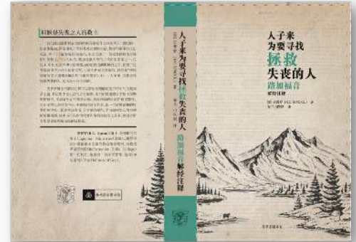
Luke by RC Sproul

The proof copy for Luke has been reviewed and approved, printing should take place sometime in March. If you would like to receive a free copy of Luke , please contact us.