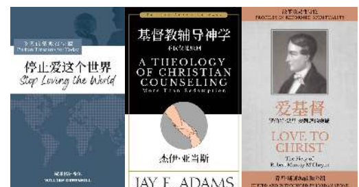
Book covers for some of the upcoming titles in 2022