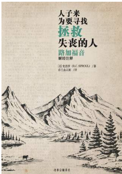
Luke - An Expositional Commentary by RC Sproul

A new addition to our library of Bible commentaries has arrived at the end of 2022. Added to Acts and Romans, RTF-USA is pleased to complete RC Sproul's 600 page expositional commentary on Luke.